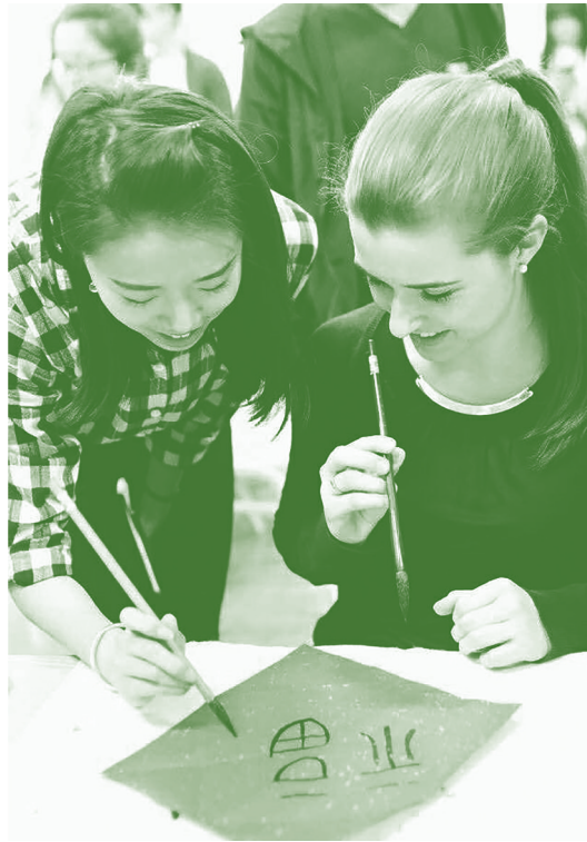
Calligraphy course at the college

through visits by two teachers from the field of logistics from the college in Tianjin to our school (2015 and 2017) for two weeks, through participation in several seminars, including at the FH Ludwigshafen, by sitting in on specialised classes at the BBS I and through visits to training establishments. In final talks at the FH and the BBS, the Chinese teachers