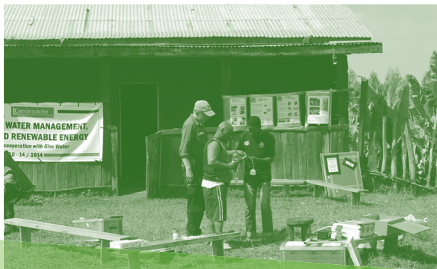
Fitting a model house with solar energy in Weira (Ethiopia)

over the past few years exemplarily in various African countries together with local protagonists and non-governmental organisations (NGO).