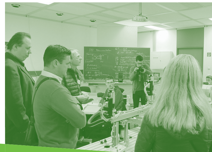
Impression of the kick-off event

More information about the project and its results can be found on our website http://www.vet-4-0.eu/