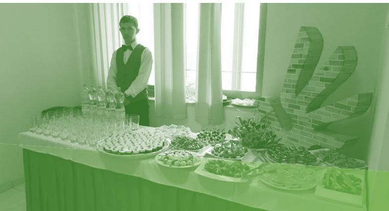
Buffet in Tirana

In addition to the theoretical and methodological knowledge, school directors and hotel managers took part in a one-week training course in Hamburg in November 2015. During this period they got a very good impression of the necessity of a close cooperation between the two places of learning, the school and the